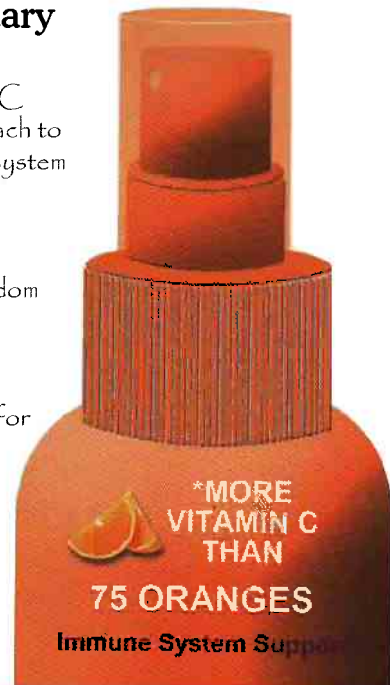
1 FL. OZ. Dietary Supplement

REBOOT: energy spray: instant energy for high performance