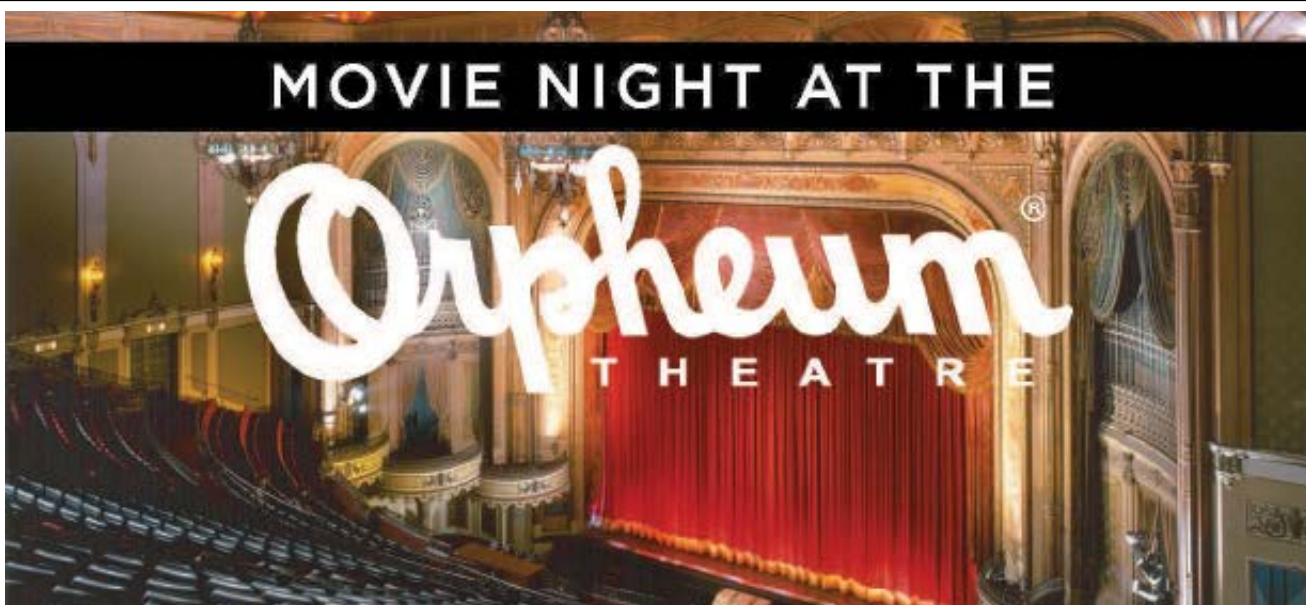
Fashion Industries Guild presents Movie Night at the Orpheum Theatre

This year the Fashion Industries Guild fund-raising event is Movie Night at the Orpheum Theatre. They will be showing the Adventures of Priscilla, Queen of the Desert, a 1994 classic. The Orpheum Theatre has been restored to its original ornate architecture of the 1920's. The event will take place on Saturday, October 3rd and will feature a VIP party prior to the movie.