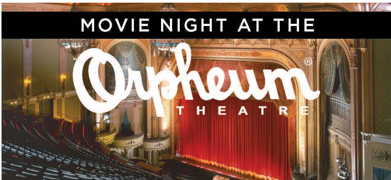
Fashion Industries Guild presents Movie Night at the Orpheum Theatre

S E C R E T A R Y & S H O P S & S E R V I C E S